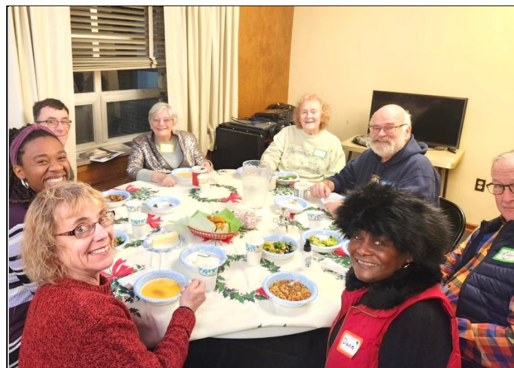
Attendees of the Soup, Salad, Song, and Sweets event on December 2, 2023. See page 3.

We dare to LIVE the LIFE of Jesus Christ, transforming discouragement into HOPE, fear into LOVE, isolation into COMMUNITY.