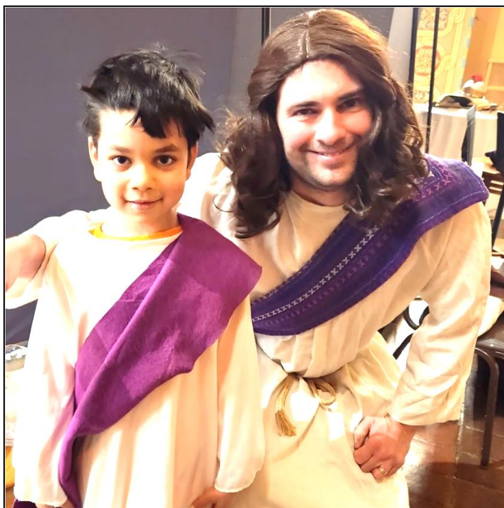
Our two actors who portrayed Jesus in the Palm Sunday Passion Play

We dare to LIVE the LIFE of Jesus Christ, transforming discouragement into HOPE, fear into LOVE, isolation into COMMUNITY.