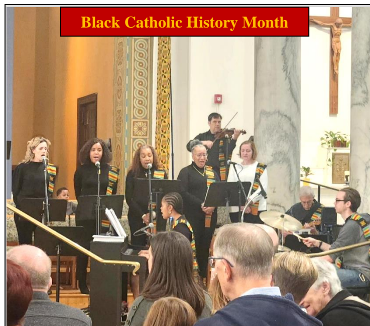
Our Gospel Choir kicked off Black Catholic History Month with an awesome setlist on Sunday, November 5.

We dare to LIVE the LIFE of Jesus Christ, transforming discouragement into HOPE, fear into LOVE, isolation into COMMUNITY.