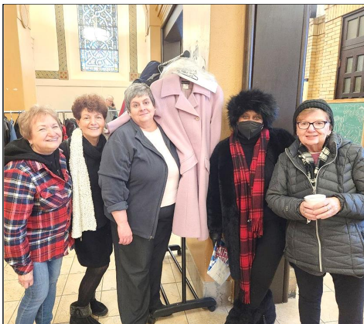
Some angels of the MLK Day Coat Giveaway on Monday, Jan. 15.

In your kindness remember me, because of your goodness, O LORD.