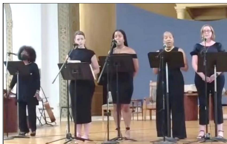
Women of the St. Monica Gospel Choir performing at the summer concert on July 16, 2023

We dare to LIVE the LIFE of Jesus Christ, transforming discouragement into HOPE, fear into LOVE, isolation into COMMUNITY.