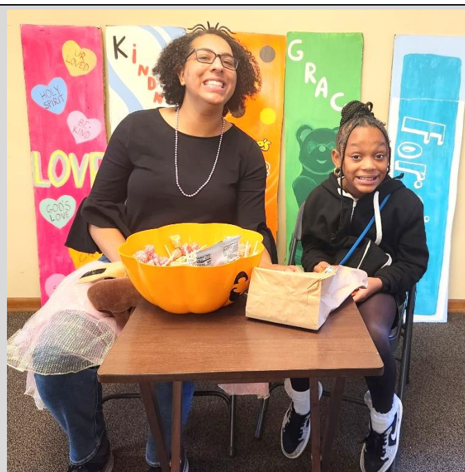
Friends at the youth Halloween event on Oct. 29, 2023.

We dare to LIVE the LIFE of Jesus Christ, transforming discouragement into HOPE, fear into LOVE, isolation into COMMUNITY.