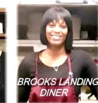
BROOKS LANDING DINER