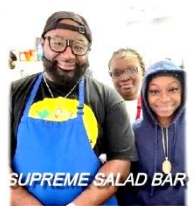
SUPREME SALAD BAR