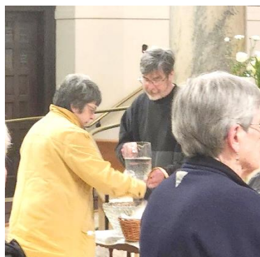
The washing of the hands at the Holy Thursday Mass at Emmanuel Church of the Deaf