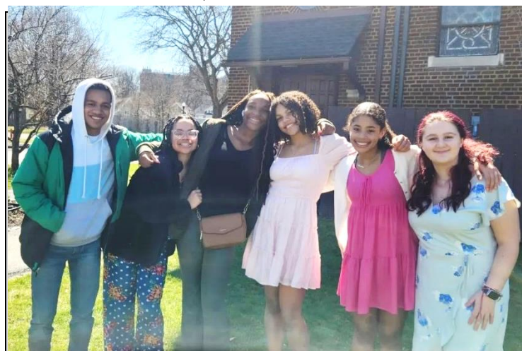
Some of our teens on Easter Sunday- awesome egg hunt helpers!

We dare to LIVE the LIFE of Jesus Christ, transforming discouragement into HOPE, fear into LOVE, isolation into COMMUNITY.