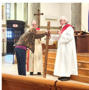
The veneration of the cross at the Good Friday service at St. Monica Church