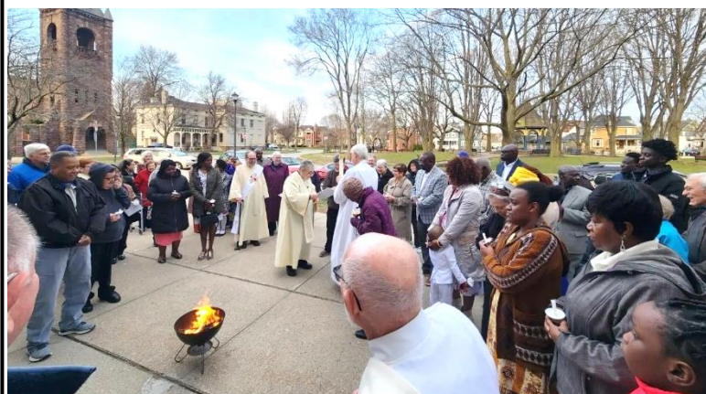
Lighting the fire at the Easter Vigil at Immaculate Conception