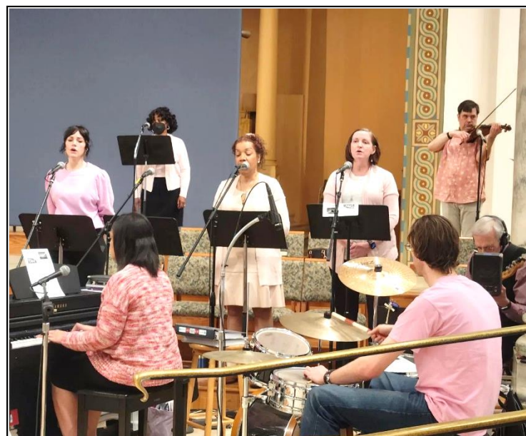
Our Gospel Choir sings "Lord, I'll Go" on the 4 th Sunday of Lent, March 19, 2023.

We dare to LIVE the LIFE of Jesus Christ, transforming discouragement into HOPE, fear into LOVE, isolation into COMMUNITY.