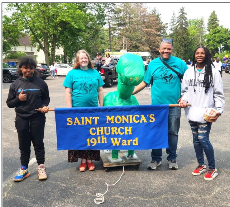
St. Monica in the Square Fair parade on June 3, 2023.

I am the living bread that came down from heaven, says the Lord; whoever eats this bread will live forever.