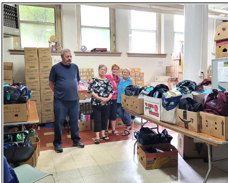
Angels of the backpack giveaway at St. Peter's Kitchen. Thank you to all who gave to get our kids ready for school!

I will give thanks to your name, because of your kindness and your truth: When I called, you answered me; you built up strength within me.