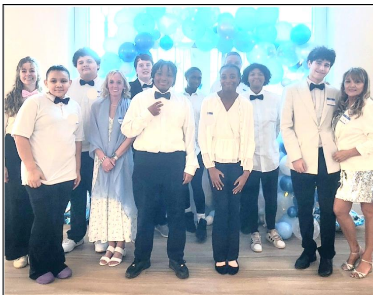
Our Youth Group had a service retreat on Sunday, March 8 th helping with a senior citizens' ball. Story on Page 3.

You were once darkness, but now you are light in the Lord. Live as children of light. — Ephesians 5