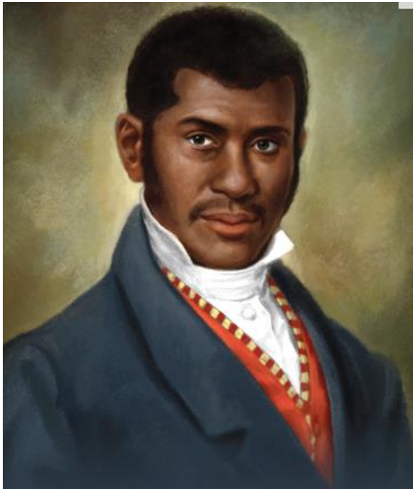
Pierre Toussaint (1766-1853)

Pierre Toussaint was born in Haiti and brought to New York City as a slave. He died a free man, a renowned hairdresser, and one of New York City's most well-known Catholics, credited by many with being the father of Catholic Charities in New York.