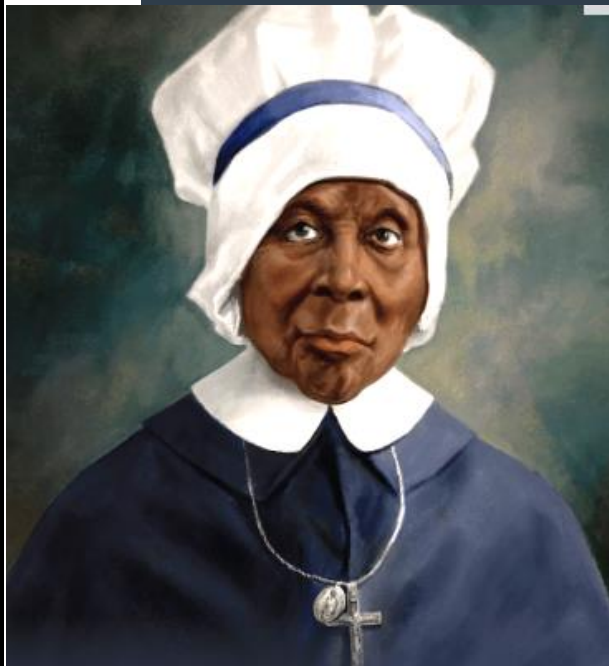
Mother Mary Lange (1787-1882)

After the death of his master, Pierre supported his master's widow and other house slaves. He was freed shortly before the widow's death. He generously assisted blacks and whites in need. He and his wife opened their home to orphans and educated them. When urged to retire and enjoy the wealth he had accumulated, Pierre responded, "I have enough for myself, but if I stop working I have not enough for others."