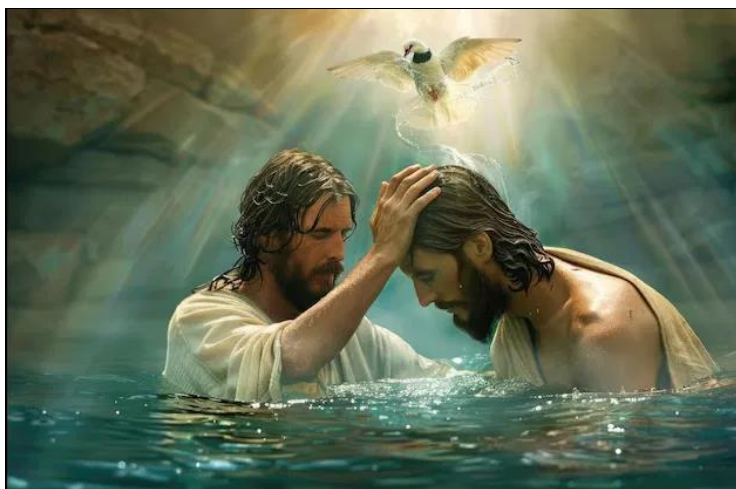
The baptism of the Lord.

We dare to LIVE the LIFE of Jesus Christ, transforming discouragement into HOPE, fear into LOVE, isolation into COMMUNITY.