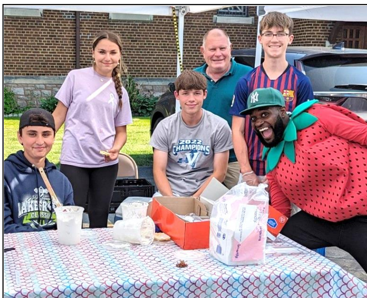
The Strawberry Festival at Westside Farmers Market on June 20.

“Sing to the LORD, praise the LORD, for he has rescued the life of the poor from the power of the wicked!”